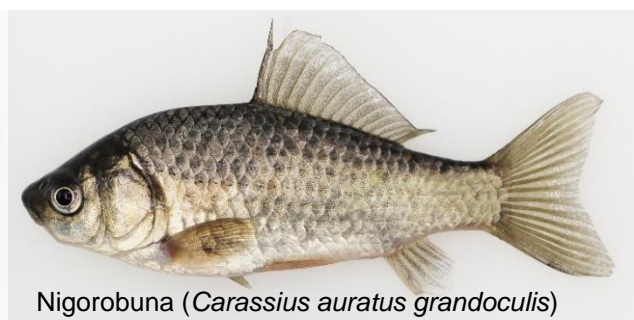
Nigorobuna ( Carassius auratus grandoculis )