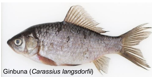
Ginbuna ( Carassius langsdorfii )

Ginbuna ( Carassius langsdorfii ), are native to Asia but have been recorded in Europe and North America. They can also go by the common name of silver crucian carp. Nigorobuna ( Carassius auratus grandoculis ) are native to Japan, specifically Lake Biwa and its tributaries. It is unclear whether nigorobuna represents a distinct species or whether it is a sub-species of goldfish ( Carassius auratus ). Both species share many identifying features with each other and those of Prussian carp, however recent genetic analysis show both these fish are distinct from Prussian carp and crucians ( Carassius carassius ).